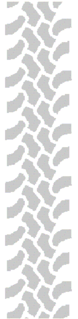
Tis the season